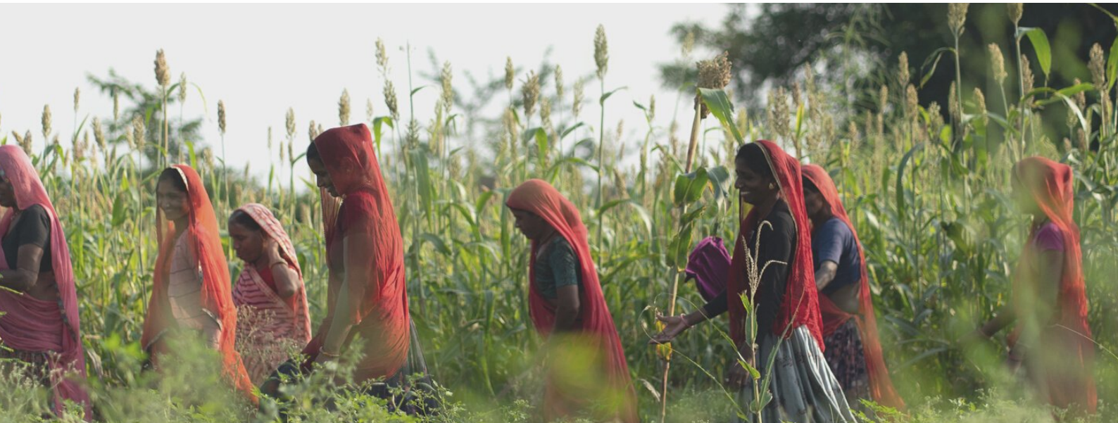
Women make their way through agricultural fields/land in Chittorgarh, Rajasthan (India).

Featuring Second Chance Education programmatic highlights and updates in India for the month of October 2021.